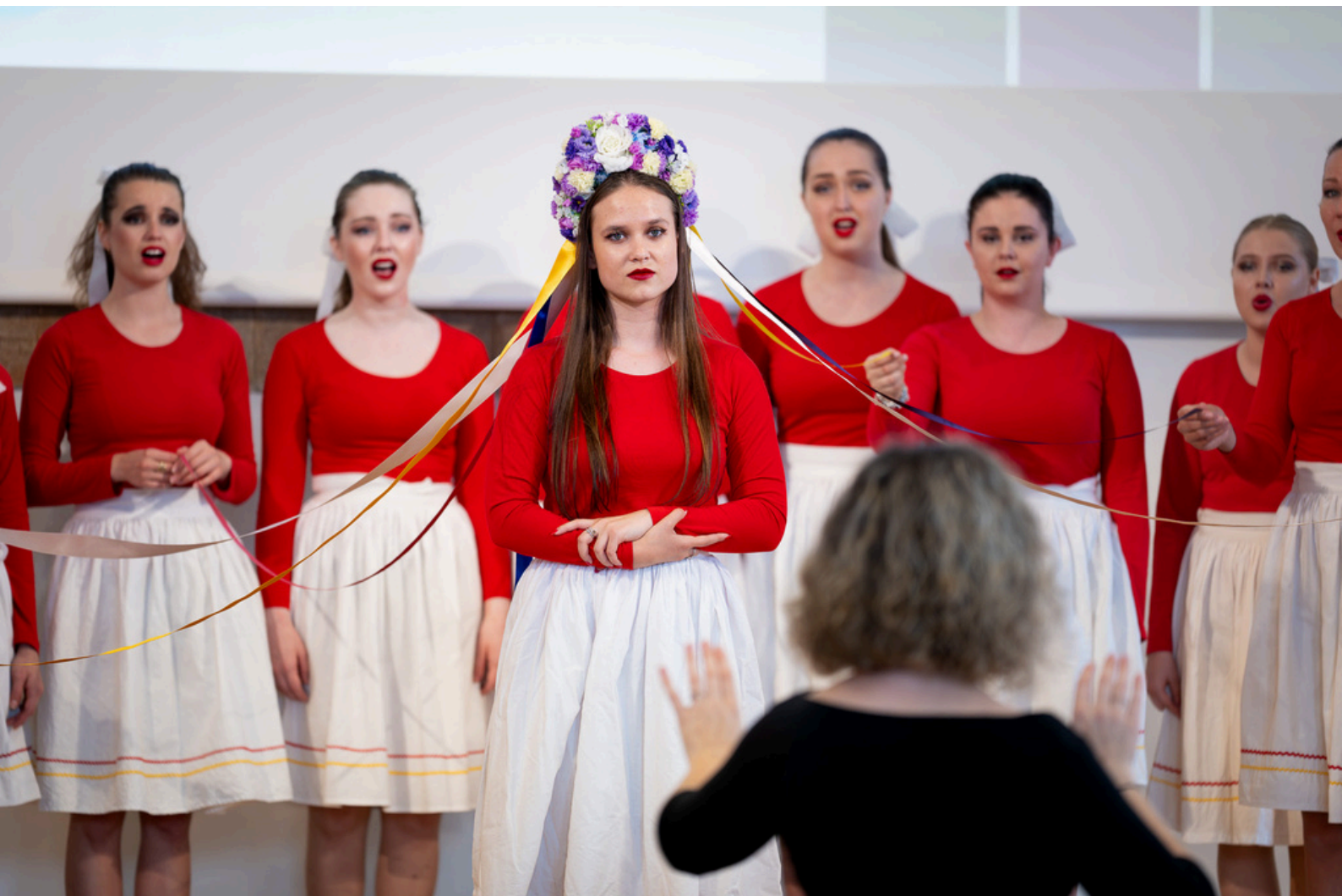
MUNDI CANTANT Competition, choir: Cansona Neosoliensis (1 June 2024, Aula UP)