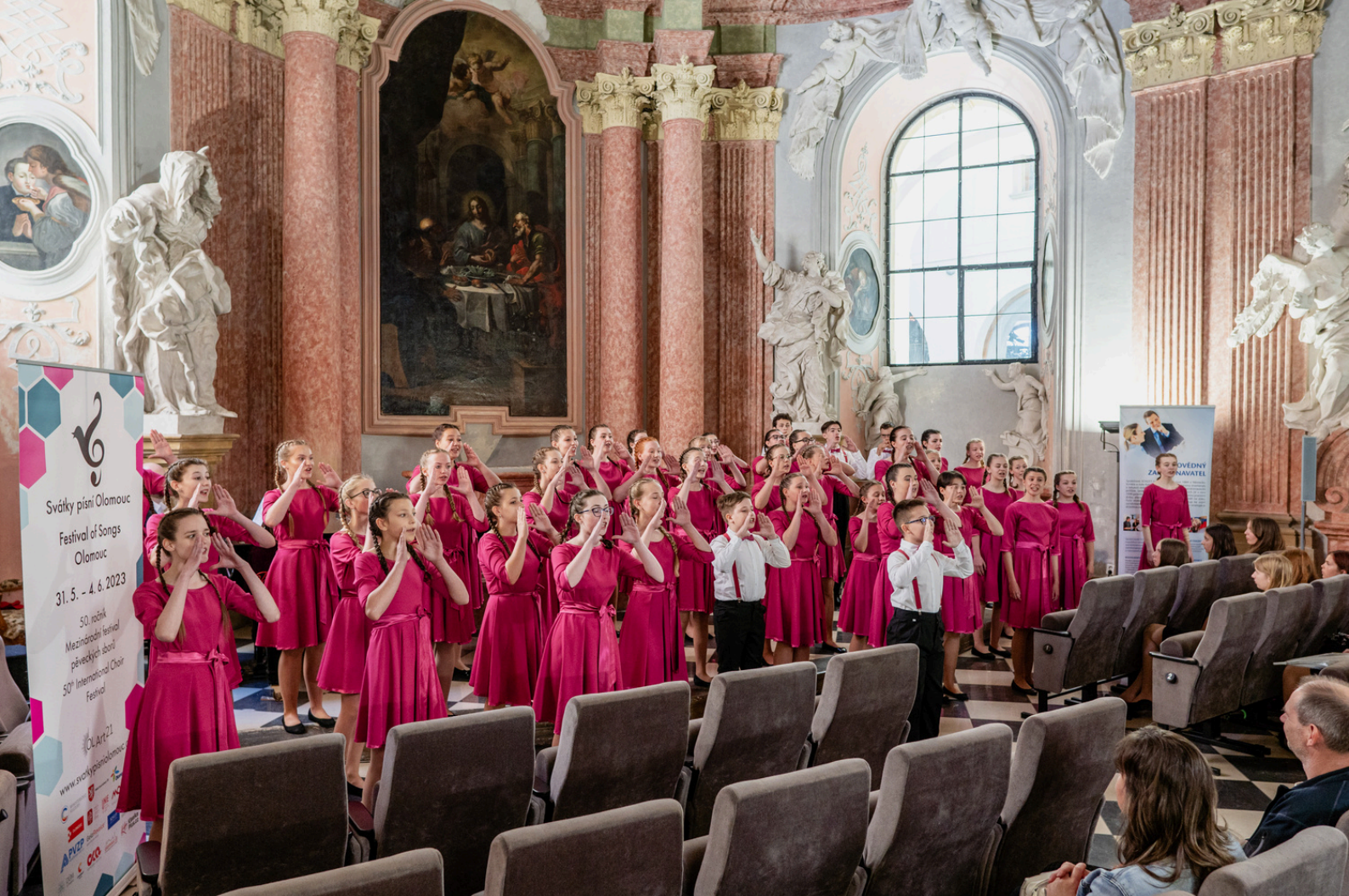
MUNDI CANTANT Competition, choir: Kajetán (3 June 2023, Corpus Christi Chapel)

The festival has been focusing on amateur music since its foundation. Its main mission is to: