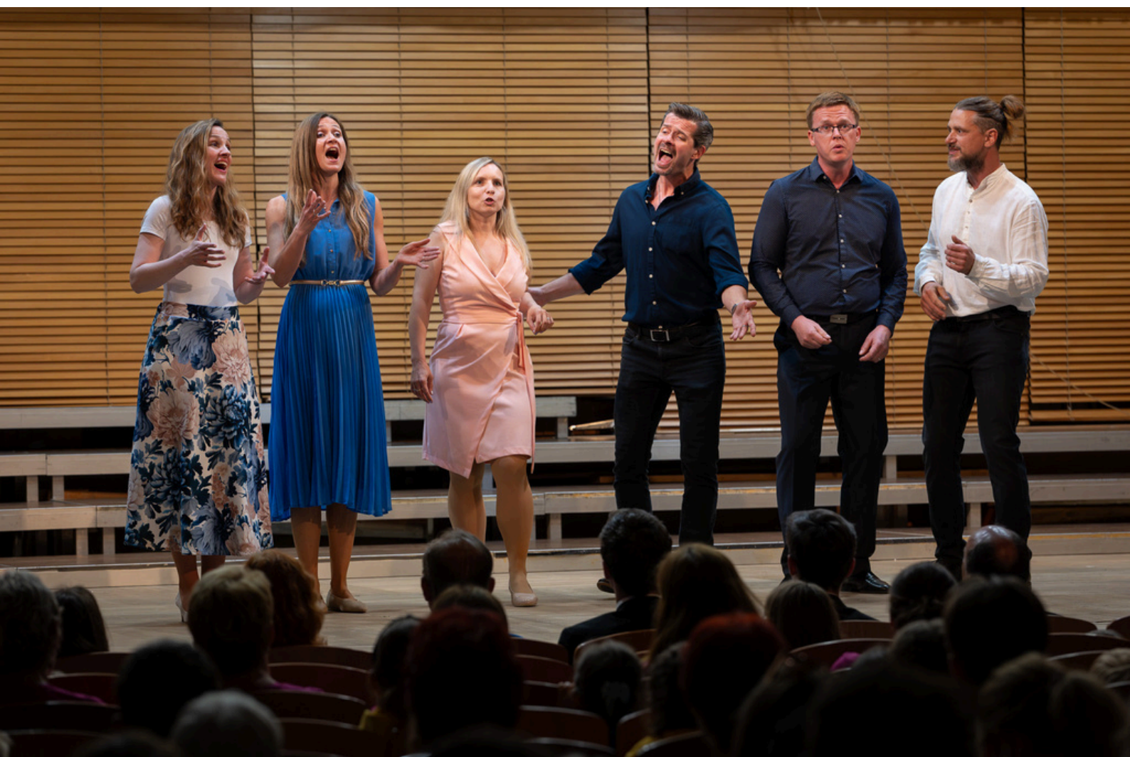
Absolute Winner Competition, vocal ensemble: Za5 (1 June 2024, Reduta MFO)